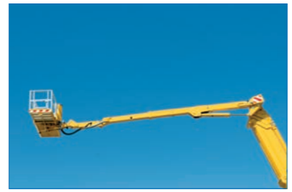
Telescopic cage boom enables more overall reach.