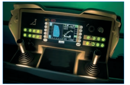
All XDT units have Bronto+ electronic control system. Control centers have full colour displays with excellent visibility.