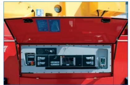
Automatic one button variable jacking.