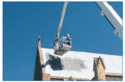
Cage rotation 90 degrees. Hydraulically extendable cage available as an option.