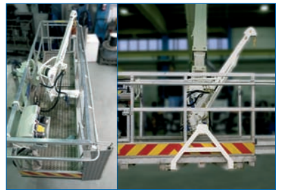
Optional material handling equipment available for the cage.