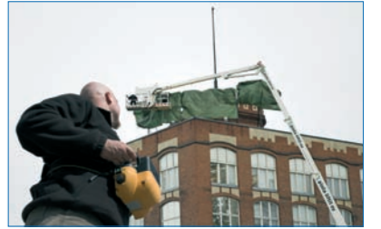
Wireless remote control available as an option.