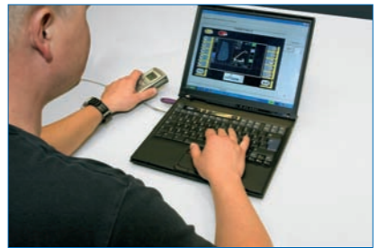
Bronto TeleControl system enables information transfer between the diagnostic system of the aerial and Bronto Skylift Customer Service. Fault analysis and telemaintenance can be performed on-line.