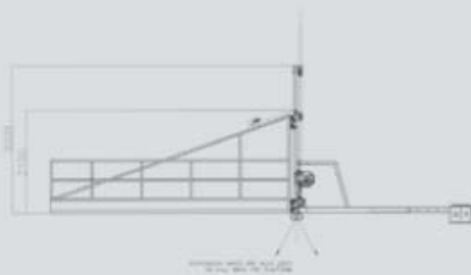
Side view of platform in use