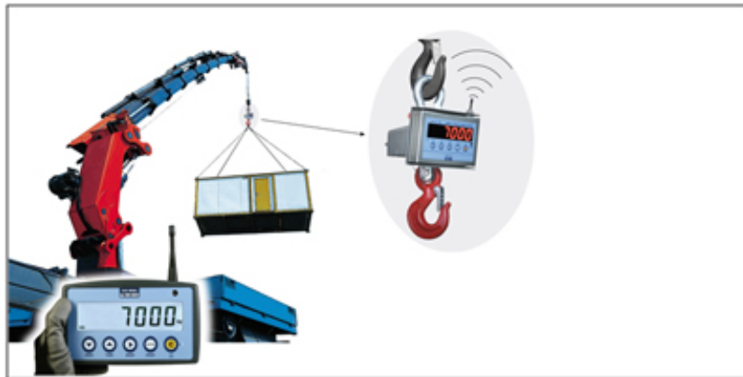
DFWPM: Single scale weight repeater application.