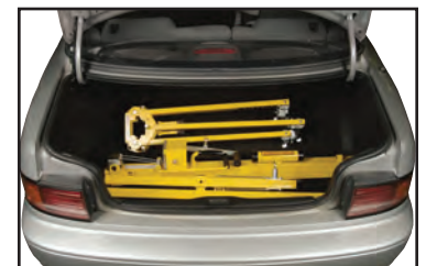
Fits in a car trunk!