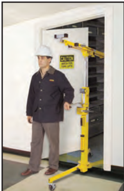
Fits through doorways!