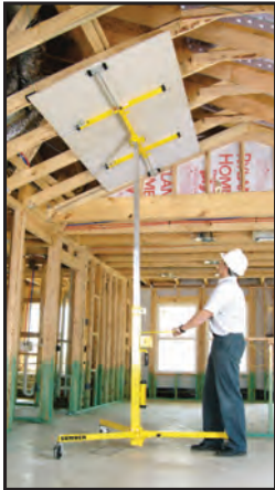
Cradle tilts up to 45° for cathedral ceilings.