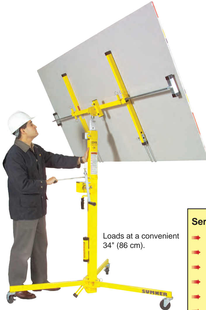
Loads at a convenient 34" (86 cm).