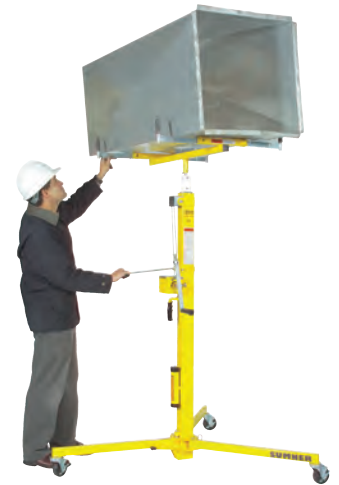
Optional HVAC/ Light Cradle Part No. 784474