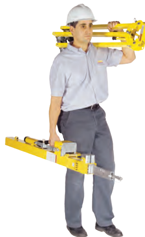
Lift conveniently disassembles for easy transport. Convenient carrying handle!