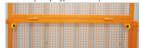
anchorage points for protective equipment